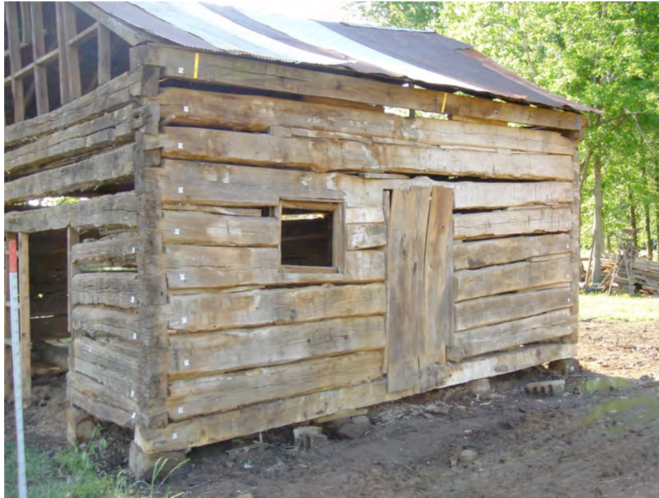
Front wall of cabin facing East