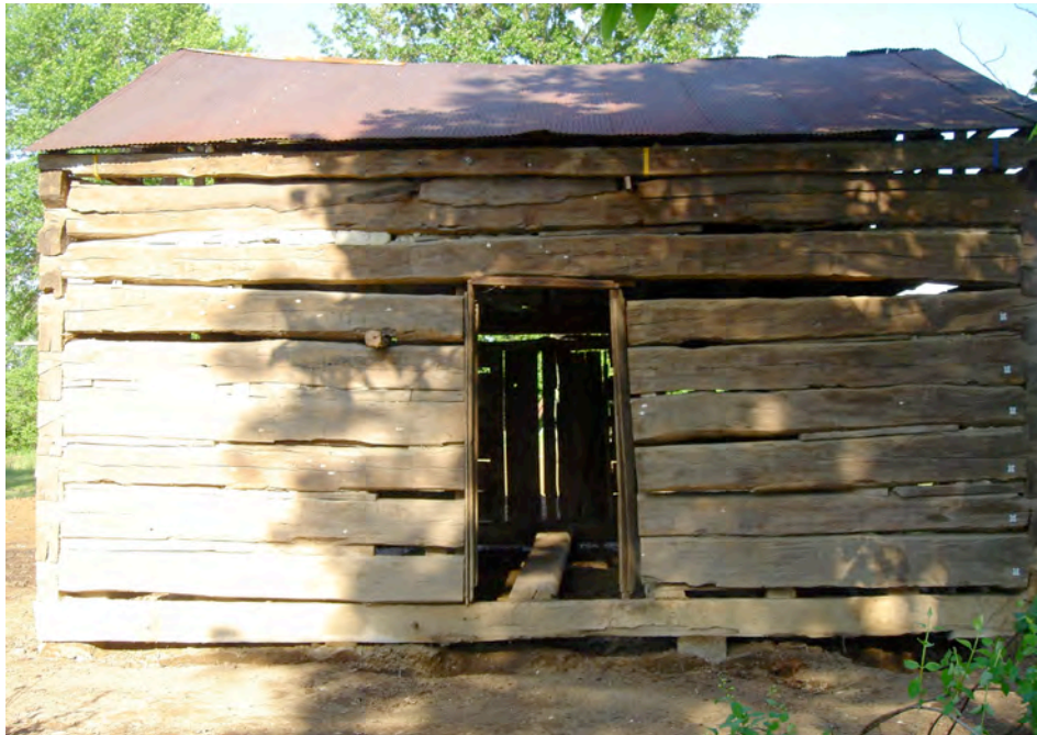
Back wall of cabin facing West