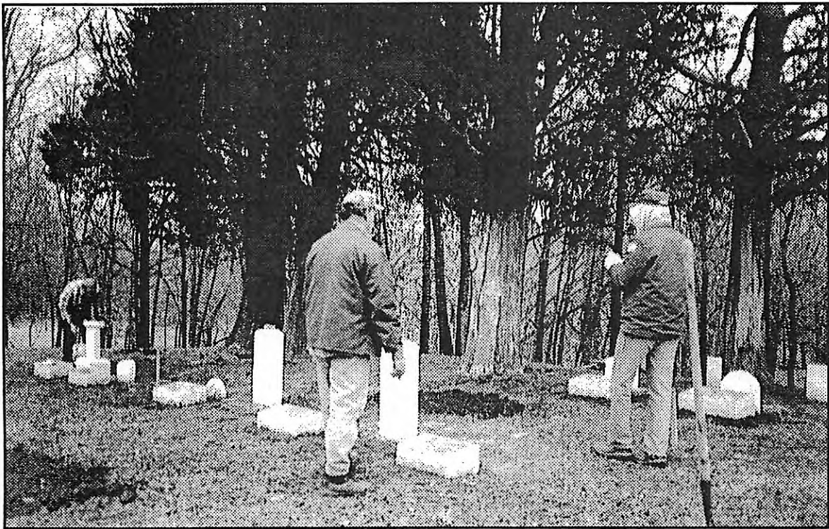
Installing the new markers at the Jacob Hunter Cemetery