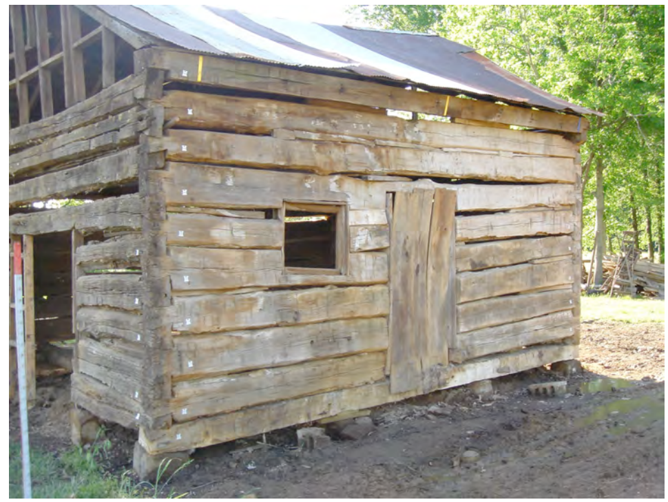
Front wall of cabin facing East